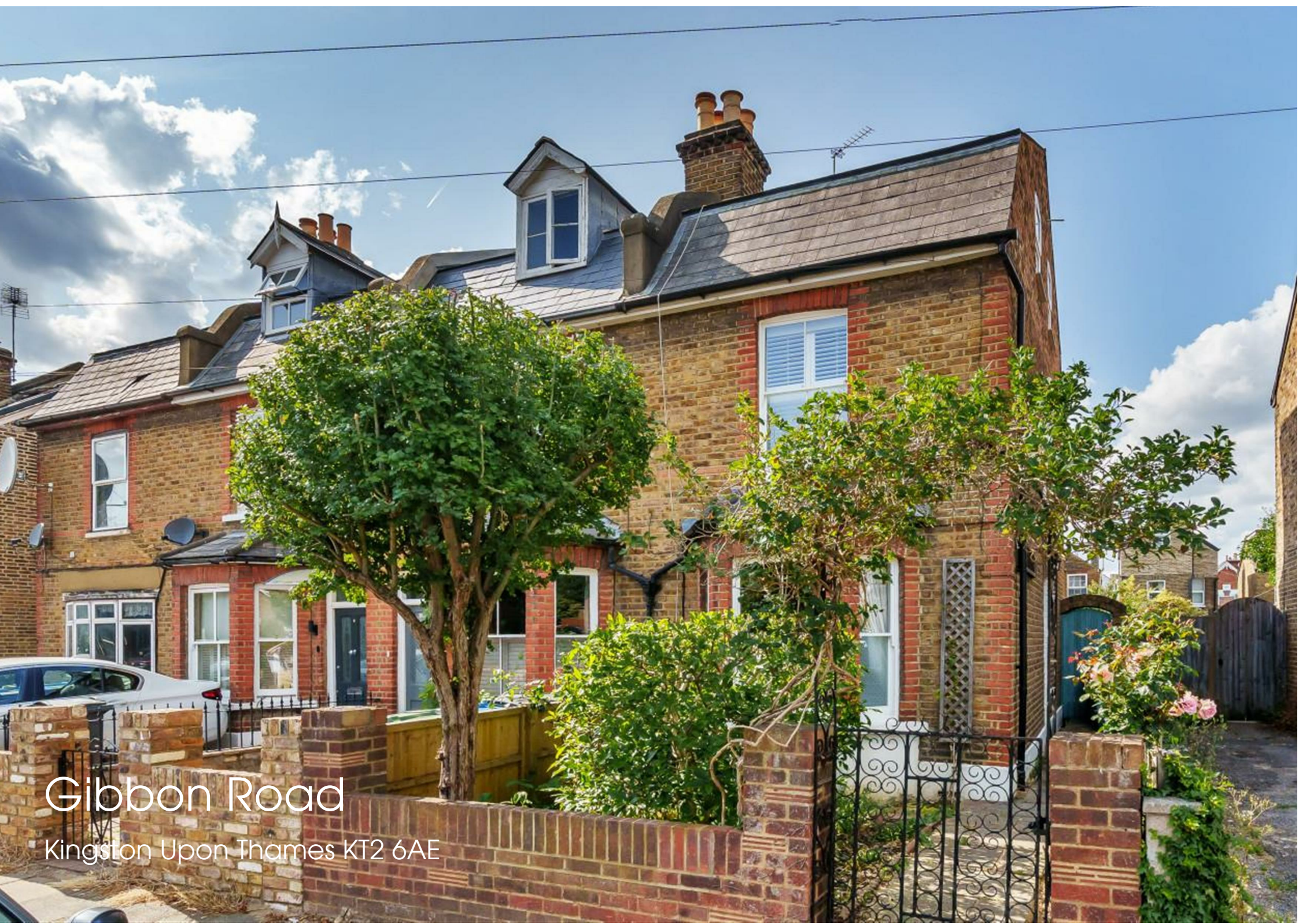
Gibbon Road Kingston Upon Thames KT2 6AE

34 Richmond Road Kingston upon Thames Surrey KT2 5ED www.gibsonlane.co.uk Tel: 020 8546 5444